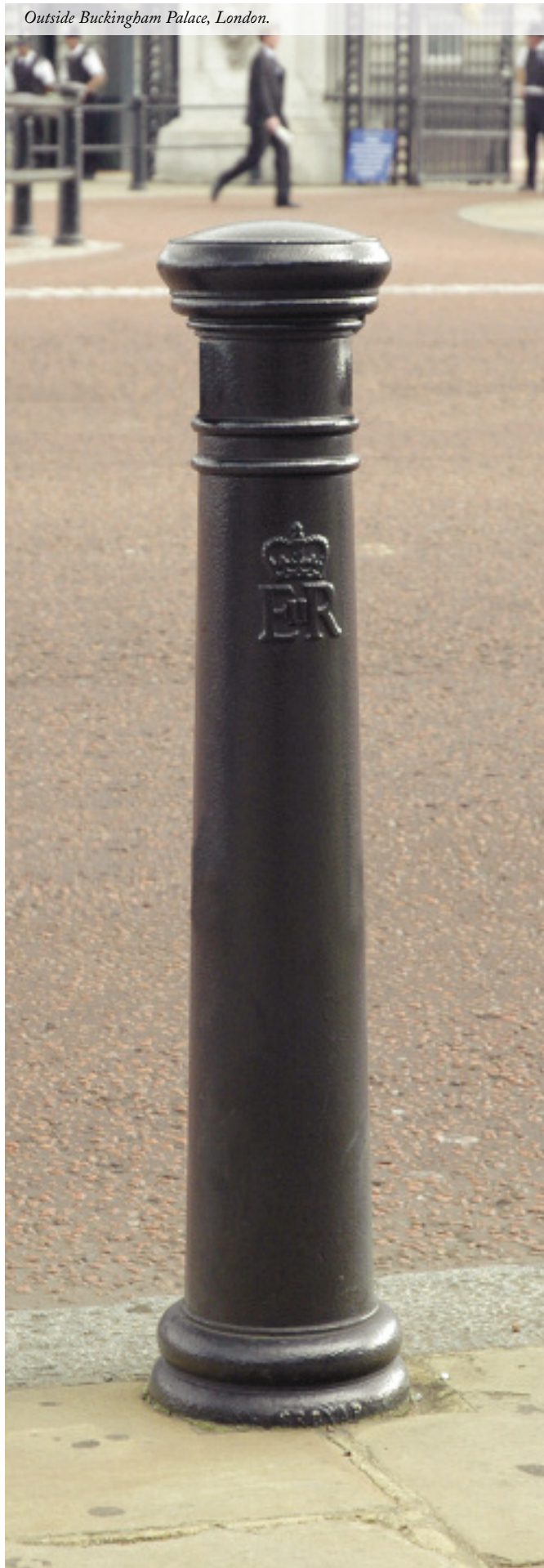
Outside Buckingham Palace, London.