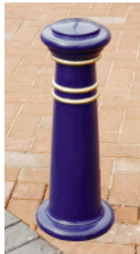
BX 1670-RT Hanchurch Short at Ravensdale Avenue, Mansfield.