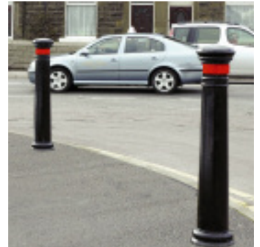
Shown with reflective tape banding.