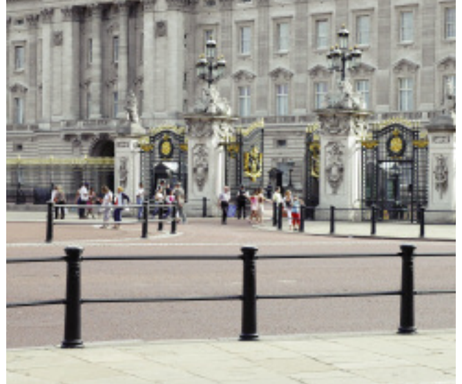
"10 years outside Buckingham Palace - Pristine condition"