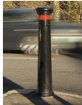
Glossop Road, High Peak.